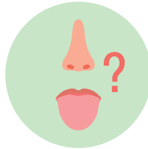
Loss of taste or smell