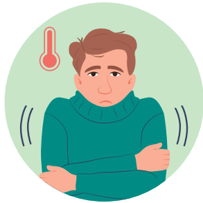
Fever and/or chills