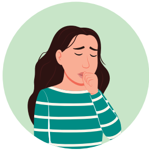
Cough or barking cough (croup)