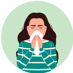
Runny or stuffy/congested nose