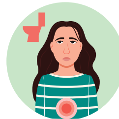
Nausea, vomiting and/or diarrhea

Anyone who is sick or has any symptoms of illness should stay home and complete the school screening tool to determine next steps